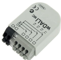
Button modul (Transmitter)