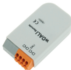
Receive modul (Receiver)