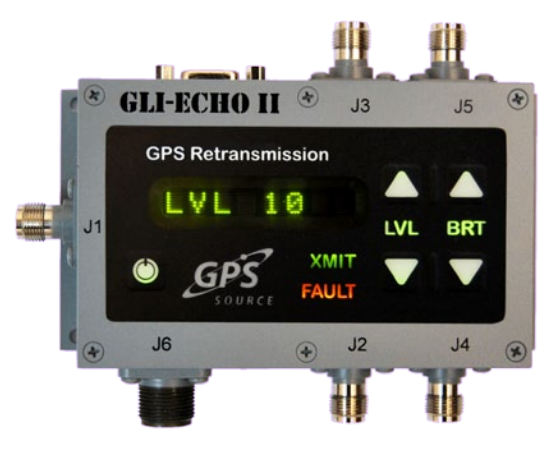
Figure 4. GLI-ECHO II LRU by GPS Source, Inc.

receivers, such as Garmin 60 or DAGR, no longer require RF cable connection to function and receive a live GPS signal. This added capability enables soldiers to eliminate cables and splitters from their vehicle's RF signal distribution system making for a lighter and more optimized vehicle setup. The system eliminates TTFF when a squad dismounts from the vehicle to perform a mission on foot. This becomes significant during assault operations, especially at night, when quick positional updates are important. Most importantly, it eliminates the need for a team leader to open a door to achieve GPS lock, drastically reducing survivability and increasing the deadly effects of IEDs and sniper fire, as shown in Figure 1.