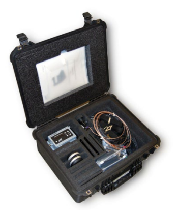
Figure 5. GPS Source's GLI Line of GPS Retransmission Kits

Examples of primary applications for kits are military Airborne units who may deploy from an aircraft and require GPS retransmission aboard vehicles acquired in the field. Units seeking an immediate solution to GPS denied locations in theater are also prime candidates for a GPS retransmission kit where optimization for a single vehicle is a lower priority than maintaining operational tempo. GPS Source provides a line of man–portable GPS retransmission kits, GPS LIVE INSIDE, or GLI, which offer an immediate solution to GPS denied vehicle applications. GLI kits are installed in the field by the Warfighter or supporting maintenance or CLS organizations. They are available with single or dual retransmit antenna capability for vehicles large or small and offer the unique features of GLI-ECHO II, including output power control, oscillation detection, BIT, and fault isolation.