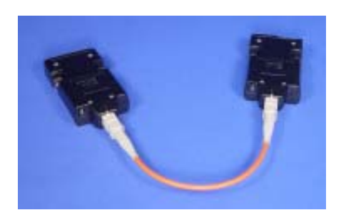
Figure 2-3 Fiber Optic Connection