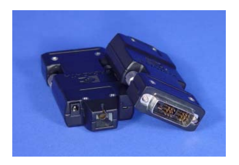
Figure 1-1 Mini-DVI TX and RX View