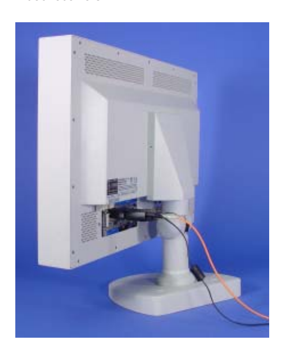
Figure 2-2 Electrical Connection