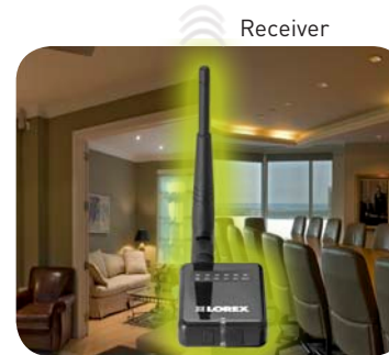
Family Room Office