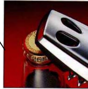
HANDY BOTTLE OPENER ON THE BACK OF THE FORK!