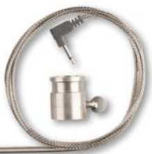
Probe, collar and rotisserie clips