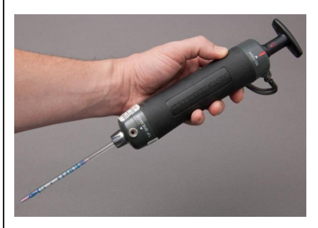
FIGURE 2. PUMP LEAK TEST.