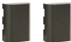
2x Batteries LP-E6