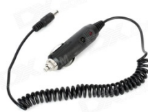
12v car adapter cable