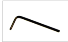
Allen Key 10-32