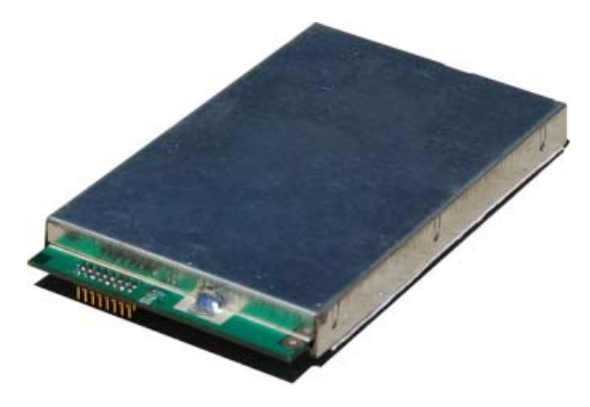
Figure 1-1. AW400Rx

AW400Rx DSP based integrated UHF receiver is the single board OEM wireless receiver intended for SCADA, outdoor telemetry applications and receiving of differential corrections and additional information by terrestrial radio channels between two GNSS receivers.