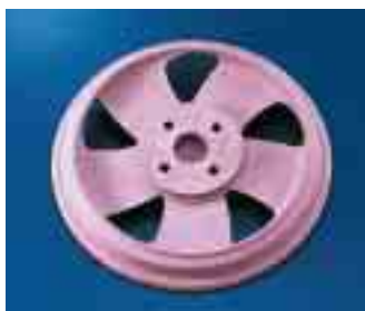
A wheel cover prototype

The MDX-650 also supports industry standard NC codes. NC codes provide connectivity with a wide variety of commercial 3D and CAD/CAM software.