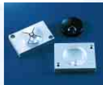
Male and female molds milled from aluminum