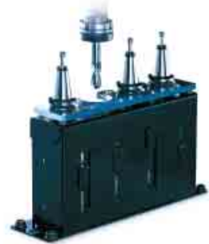
The MDX-650 with ATC automatically changes tools by specifying the tool's stock number from the included CAM software.