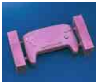
Small part prototype