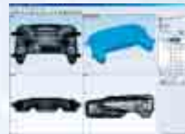
MODELA Player 4

MODELA Player 4 is a CAM software application that accepts IGES, DXF* and STL files exported from most popular industrial 3D CAD software programs. It is used to generate proportional 3D scaling, identify milling direction and to automatically generate and display the tool path. MODELA Player 4 supports tool changing when used with the Automatic Tool Changer (ATC) and automatic side cutting when used with the Rotary Axis Unit. It can also be used for 3D engraving. *3D DXF compatible with AutoCAD® R12