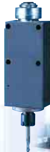
High Precision Spindle ZS-650TY

A high-precision ATC spindle is included with the ATC, negating the need to purchase any additional spindles.