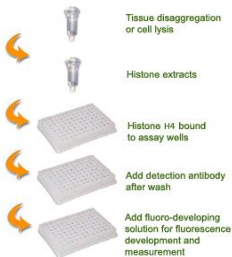
Schematic procedure of the EpiQuik™ Total Histone H4 Quantification Kit (Fluorometric)

The EpiQuik™ Total Histone H4 Quantification Kit (Fluorometric) is designed for measuring total histone H4 amount. In an assay with this kit, the histone proteins are stably spotted on the strip wells. The histone H4 can be recognized with a high-affinity antibody and detected with a signal reporter, followed by a fluorescence development reagent. The ratio of histone H4 is proportional to the intensity of fluorescence. The absolute amount of histone H4 can be quantified by comparing to the standard control.