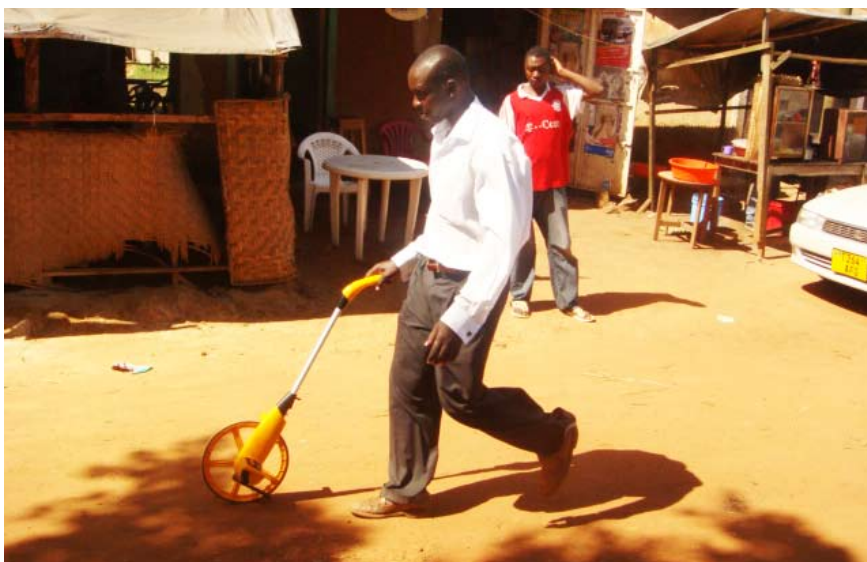
Distance measurement using an odometer

Set up a consumer database using Microsoft Access to receive all data collected during field investigation which will be used in setting up the new billing database.