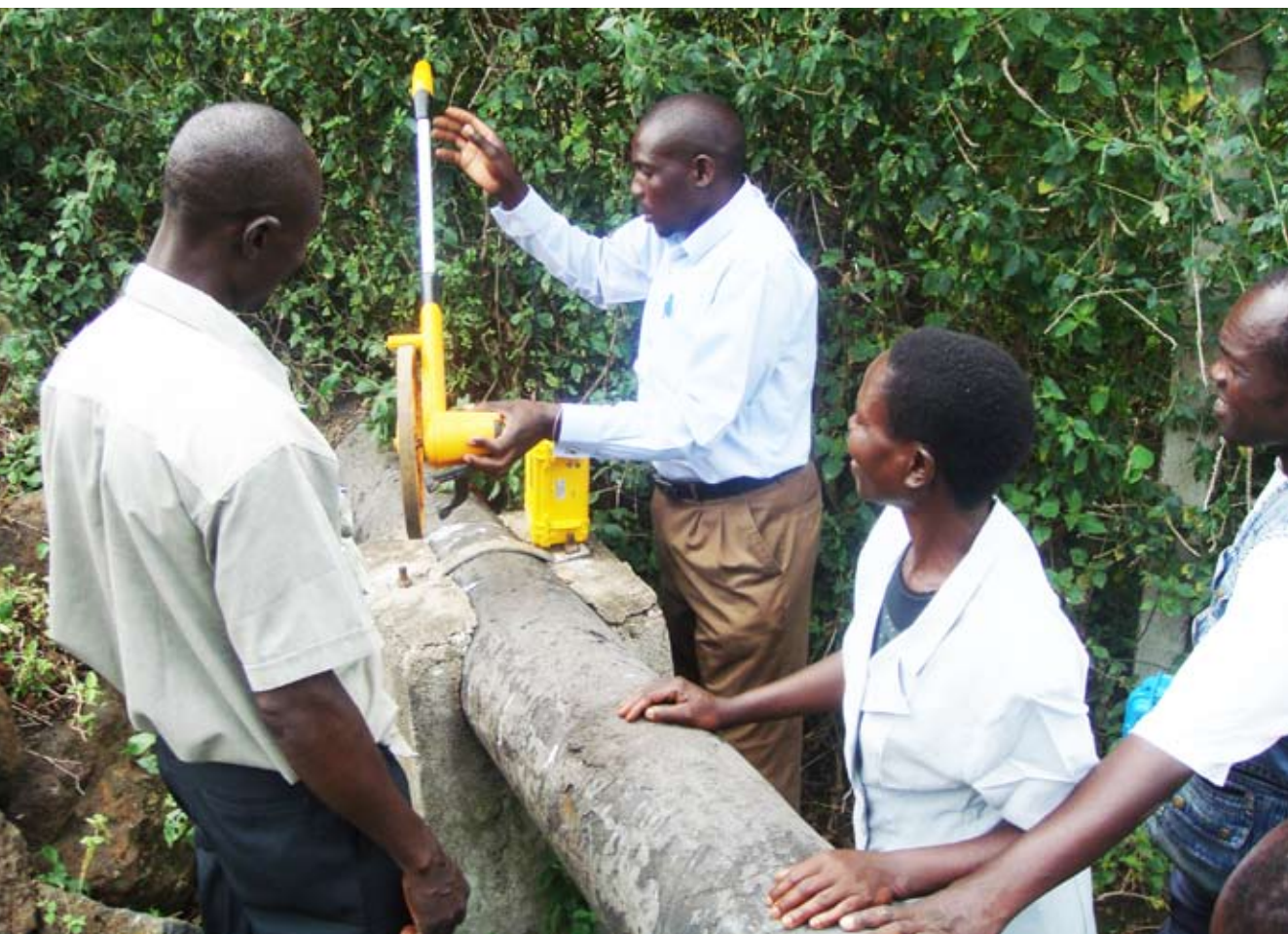
Demonstration on how to carry out Block mapping.