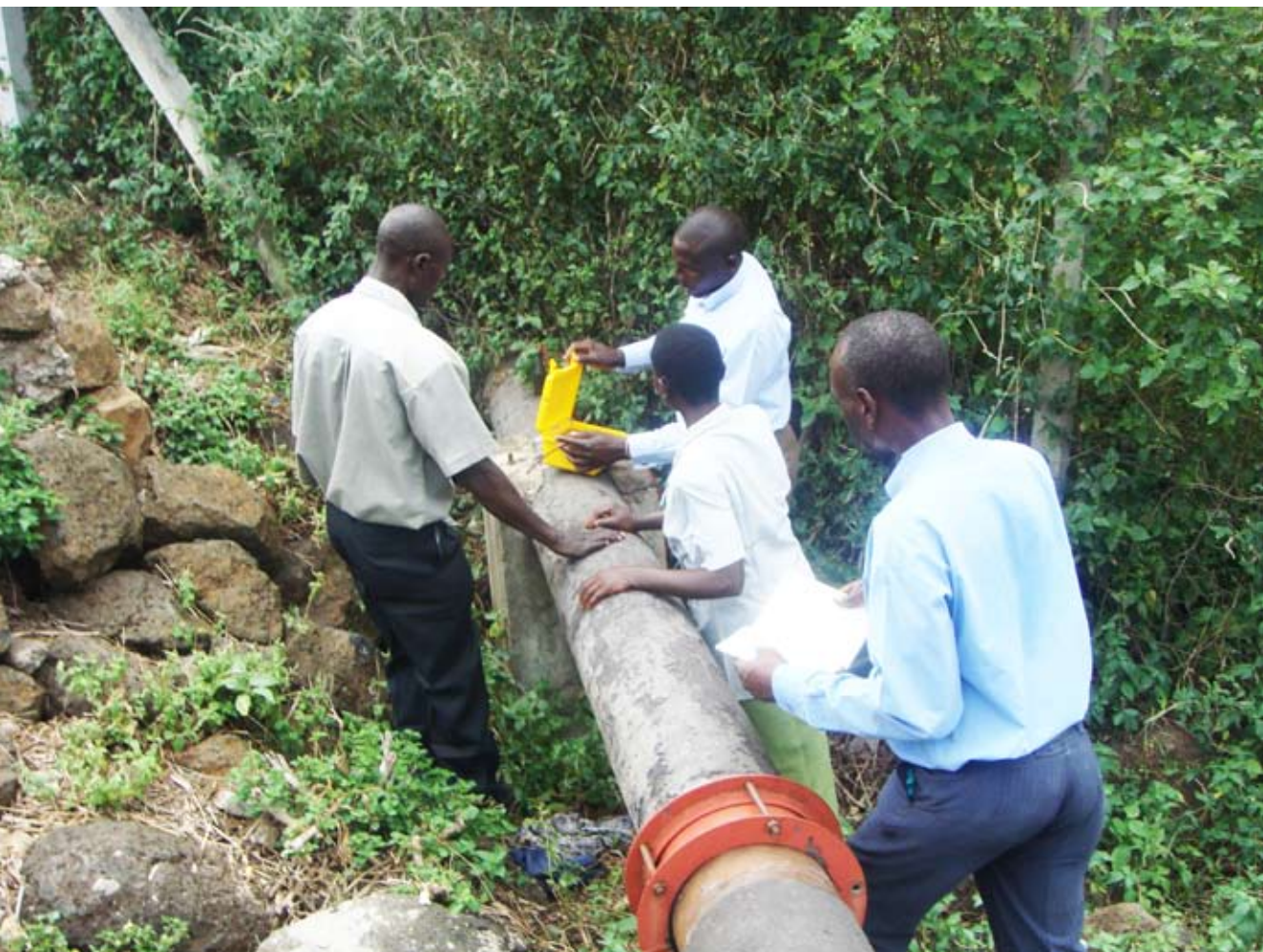
Field work - Block mapping.