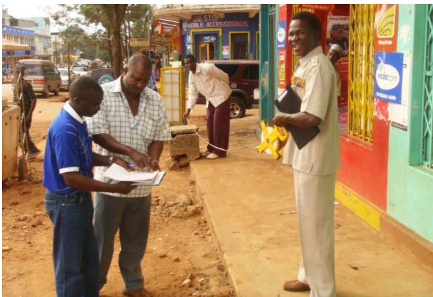
Measurement and mapping of meter location