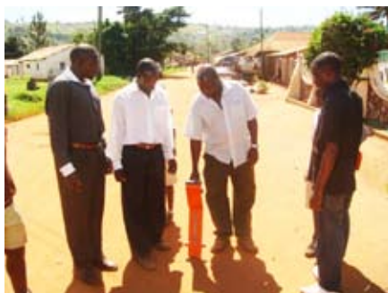
Tracing an underground metallic pipe using an electronic pipe detector