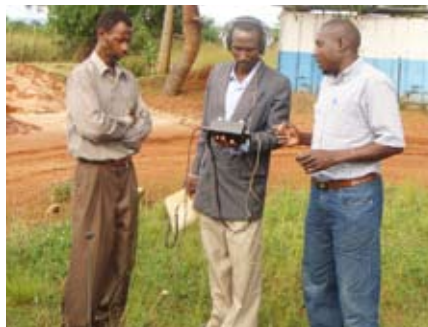
Tracing an underground plastic pipe using an electronic pipe detector