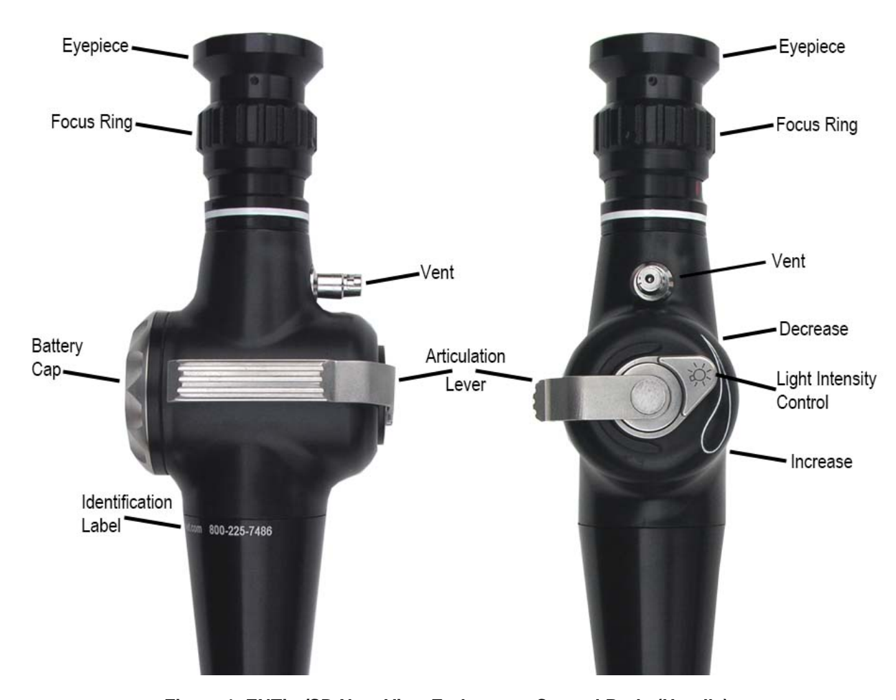
Figure 1. ENTity/SD NasoView Endoscope Control Body (Handle)