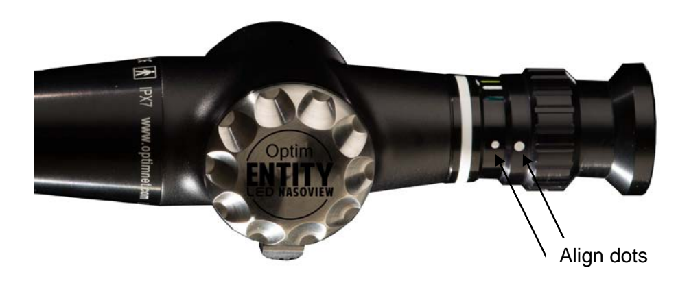
Figure 6. Alignment of White Focus Ring Marks

When using a video camera, be sure to align the white dot on the Control Body of the scope with the white dot on the Focus Ring. This setting will optimize the focusing capabilities of your camera system. Call Optim LLC at +1.508.347.5100 to order video adapters, cameras, monitors and accessories for Optim's Nasopharyngoscopes.