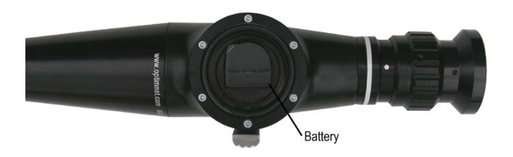
Figure 4. ENTity/SD NasoView Endoscope Battery Compartment in Control Body

The ENTity/SD NasoView's internal LED light source operates on a single, Lithium ion battery and provides approximately 40 minutes of continuous operation when a new battery is fully charged. When the battery is drained, the light will flicker on and off indicating it is time to recharge the battery. To remove the battery, simply unscrew the stainless steel battery cap and turn the scope handle over so the battery drops out into your other hand. Please take care not to let the battery fall to the floor or onto a hard object, which could damage the battery. To insert a new battery, align the battery with the cutout in the battery compartment, making sure the end of the battery with the two gold electrical contacts is inserted into the battery compartment cap by screwing the cap clockwise until a tight seal is made. Leak test the scope in water to ensure that the battery compartment is sealed.