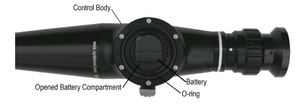
Figure 8. Battery compartment open for replacing O-ring

Over time the O-ring on your endoscope battery compartment may become dry. To prevent the O-ring from cracking and falling off we recommend replacing the O-ring with the provided greased O-ring every 6 months or 300 disinfectant cycles.