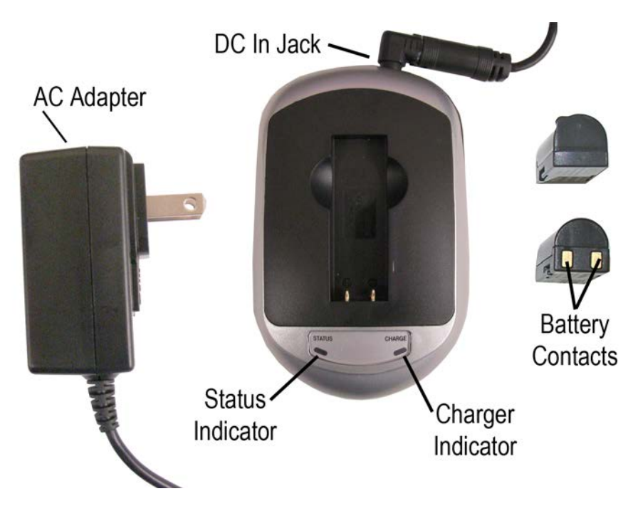
Figure 5. Battery Charger and End Views of Battery