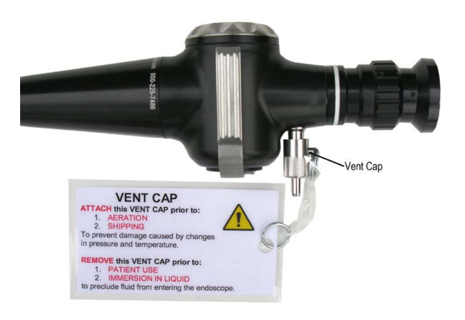
Figure 7. Control Body with Vent Cap Attached

WARNING: Remove the Vent Cap prior to immersion in cleaning and disinfecting solutions.