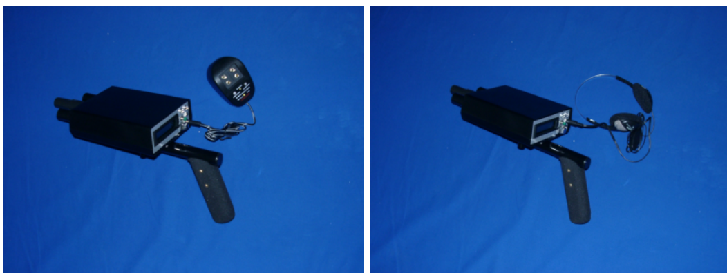
Figure 3: Connection of Charger and Headphones

Figure 2 shows how to connect the three probes to the control unit. The bigger probe has to be placed in the middle and the two smaller probes has to be plugged in at each side. Do it without any unnecessary application of force!