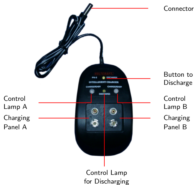
Figure 7: Front View Charger

Figure 7 indicates the front side of the charger and its control elements.