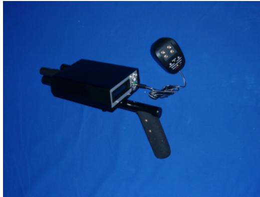
Figure 8: Connection of the Charger

To load the Bionic 01 the delivered charger has to be connected with the control unit in the provided input, like represented in figure 8.