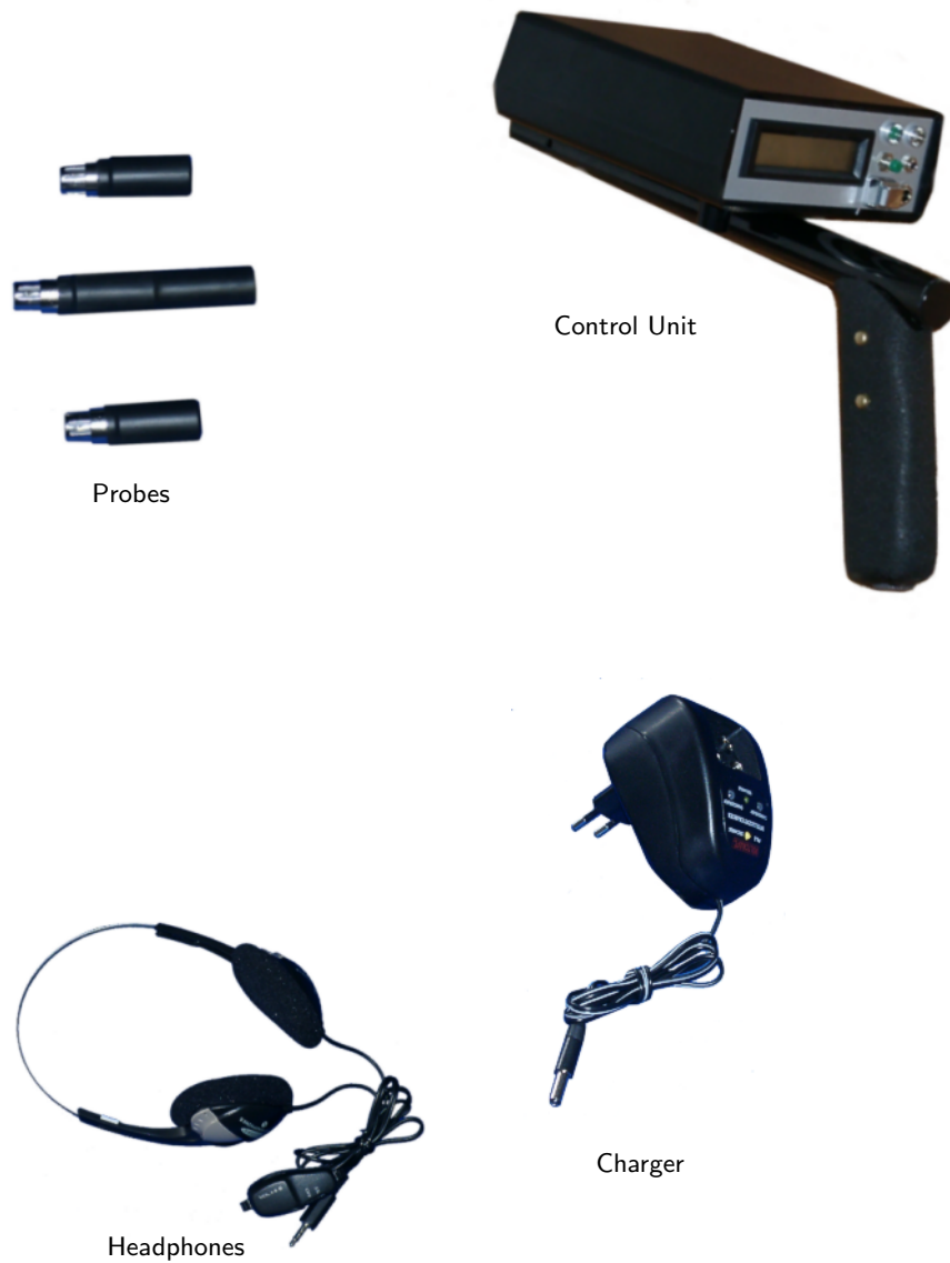
Figure 1: Scope of Delivery