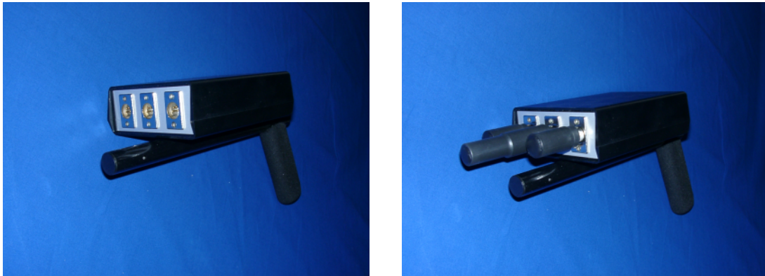
Figure 2: Connection of Probes

In this section is explained how to assemble the device and how to prepare a measurement.