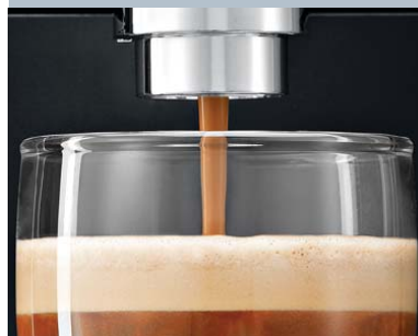
The perfect Espresso