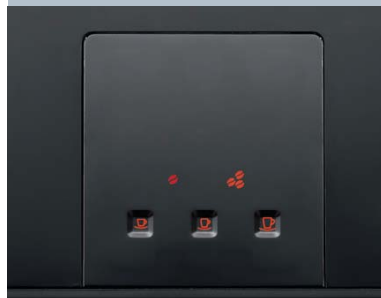
Extremely simple operation