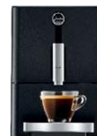
1 Café Crème