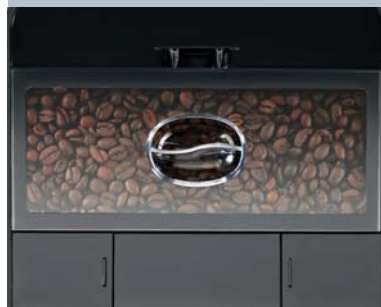
Silicone sealed bean container