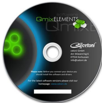
CD-ROM QmixElements, including: