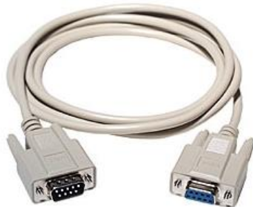
RS232 Connection Cable