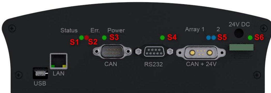
Image 4 - LED signals on front panel

The front panel contains various LEDs showing you the status of the device.