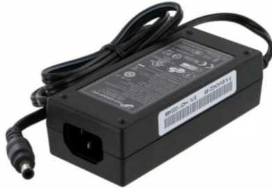
24V Power Supply

The following items should be included in the delivery: