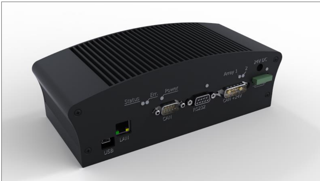
Image 1 - ceLED LED array controller V2

The LED array controller contains the control electronics for the LED array modules and PC interfaces.