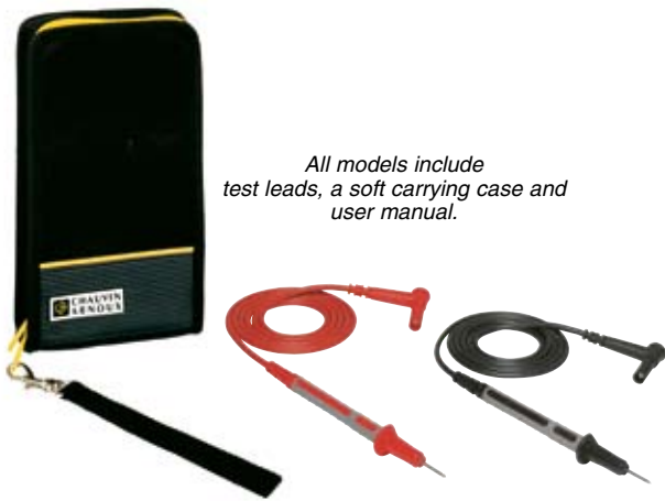
All models include test leads, a soft carrying case and user manual.