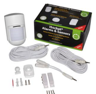
KIT1 for burglar alarm (Model: ISKIT1)