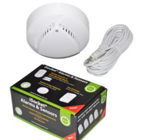
KIT2/KIT3 for fire alarm (Models: ISKIT2/ISKIT3) (Model: ISKIT4)