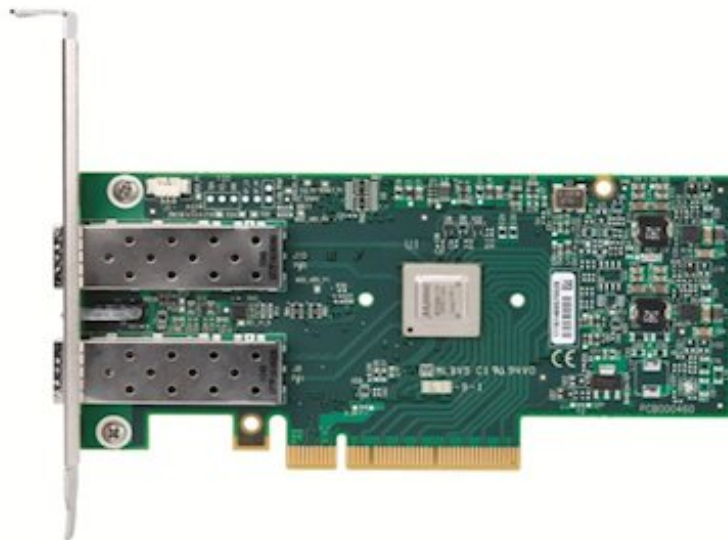
Figure 1. Mellanox Connect X-3 10GbE Adapter for System x (3U bracket shown)

Mellanox's ConnectX-3 and ConnectX-3 Pro ASIC delivers low latency, high bandwidth, and computing efficiency for performance-driven server applications. Efficient computing is achieved by offloading from the CPU routine activities, which makes more processor power available for the application. Network protocol processing and data movement impacts, such as InfiniBand RDMA and Send/Receive semantics, are completed in the adapter without CPU intervention. RDMA support extends to virtual servers when SR-IOV is enabled. Mellanox's ConnectX-3 advanced acceleration technology enables higher cluster efficiency and scalability of up to tens of thousands of nodes.