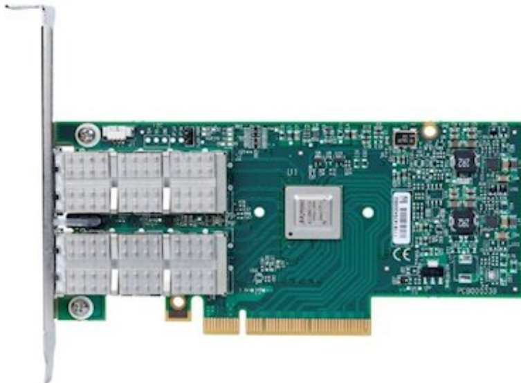
Figure 2. Mellanox ConnectX-3 40GbE / FDR IB VPI Adapter for System x with 3U bracket (required ASIC heatsink not shown)

Figure 2 shows the Mellanox ConnectX-3 40GbE / FDR IB VPI Adapter (the shipping adapter includes a heatsink over the ASIC but the figure does not show this heatsink)