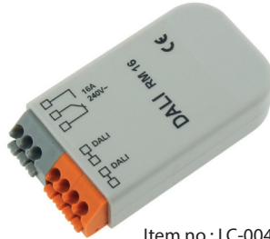
Item no.: LC-004-400