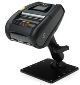
Plate and RAM mount arm permits compact and fixed mounting to a forklift.