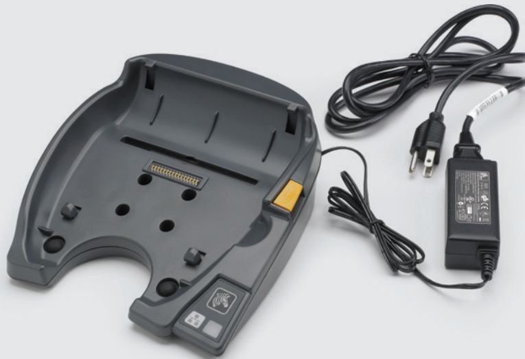
QLn420 Charging and Ethernet Cradle