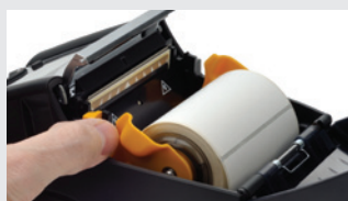
Intuitive peeler operation