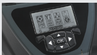
Easy-to-read display with larger, higher-resolution screen