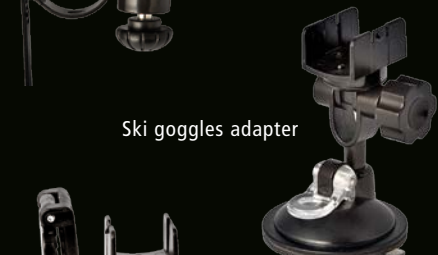
Ski goggles adapter