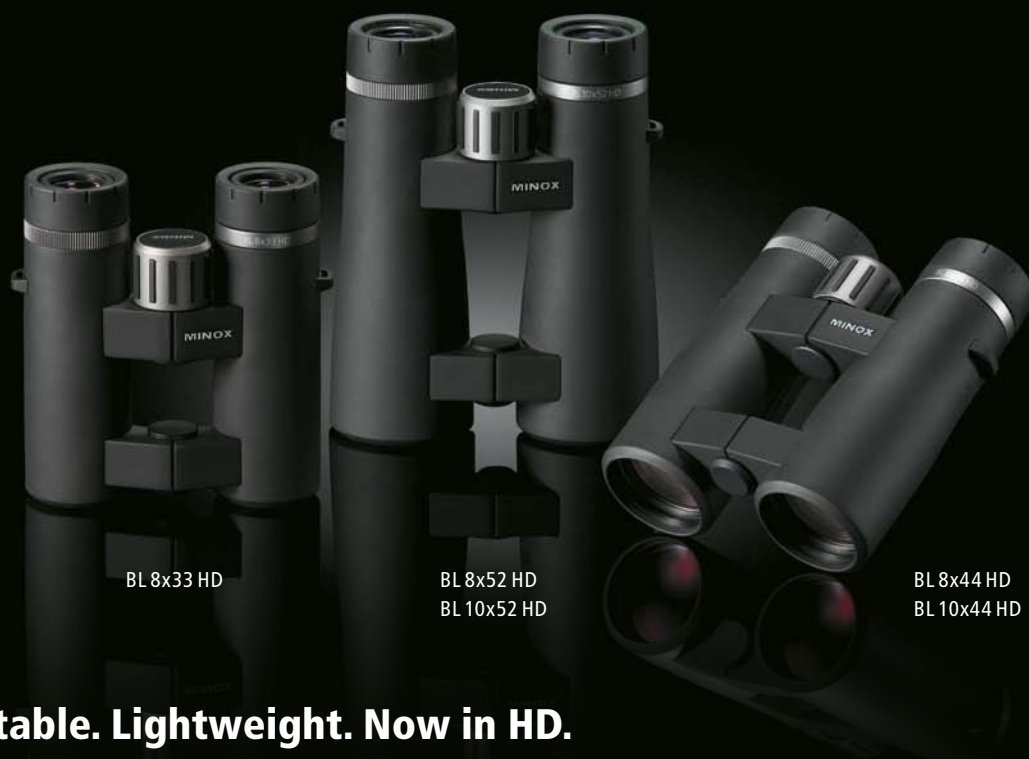
BL 8x33 HD