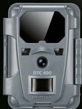
DTC 600 Grey

The new MINOX DTC 600 innovatively expands the present range of use – the black IR-filter in front of the flash reduces the wavelength strong enough to make it completely invisible to wildlife. Also invisible to the human eye, the DTC 600 is an ideal tool for protecting property and for personal safety. The intelligently designed and integrated IR-sensor allows for greater flexibility and efficiency while documenting activity in the area. The sensitivity of the IR-sensor can be individually adjusted to exclude the recording of unwanted movements caused by twigs, grasses, and other irrelevant objects.