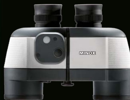
BN 7x50 C Also available in black