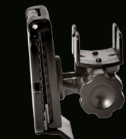
Suction cup adapter