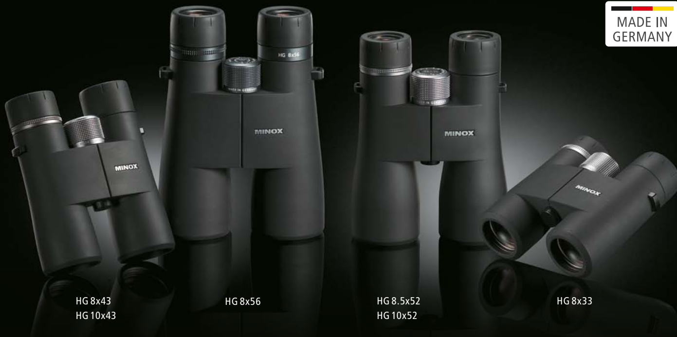
HG 8x43 HG 10x43