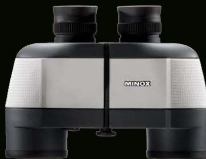
BN 7x50 Also available in black

Equipped with an analog compass, high-performance precision optics and a robust housing, the MINOX BN 7x50 C is the true classic binocular in the MINOX Nautic Line. The analog compass and graticule allow for a quick determination of heading and distance calculation to remote objects.