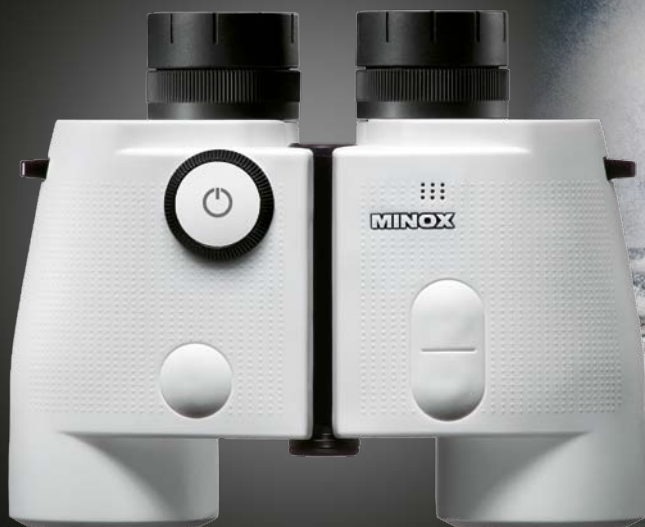
BN 7x50 DC / BN 7x50 DCM Also available in black