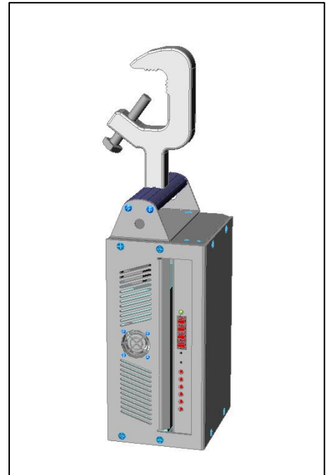
Figure 3 PDS-375 TR with C-Clamp

The PDS-375 can also be setup on a table, shelf, or other suitable flat surface. Be sure that adequate clearance for ventilation is maintained. Do NOT seal the PDS-375 up in a box or other un-cooled enclosure. If environmental protection is required, the unit may be installed in a suitable and properly ventilated NEMA 3R enclosure. Contact City Theatrical for details.