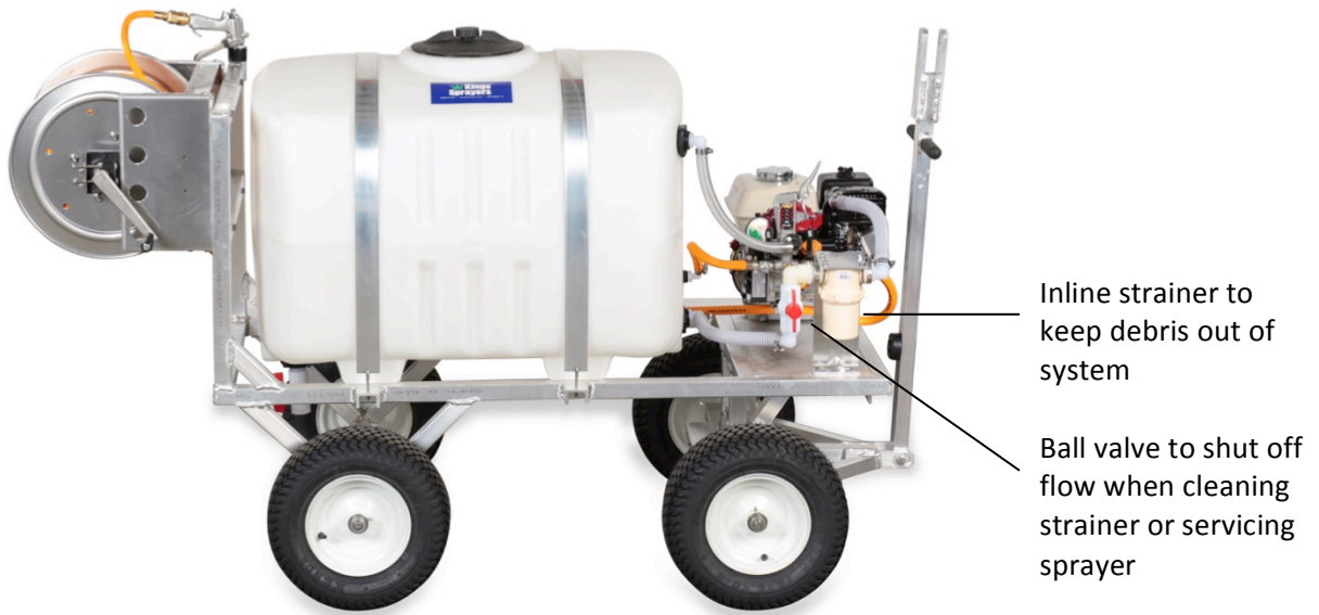
Figure 1: Side View

Lever to engage pressure regulator. Pull down and lock into place to engage. Pull up to put regulator back into bypass mode.