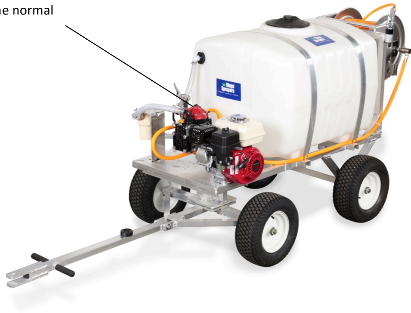
Figure 3: Front View

Accumulator / Upper air chamber – Fill with 20 psi or 20% of the normal operating pressure