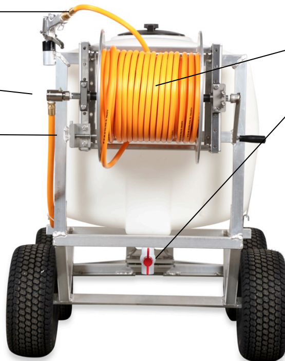
Figure 4: Back View