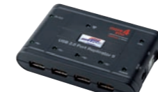
USB 2.0 Port Replicator II (EU) with Network port