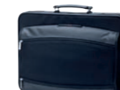
17" XXL Case