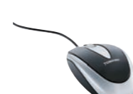
USB optical scroll wheel mouse