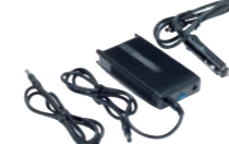
Notebook car adapter