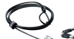
Kensington Micro Saver