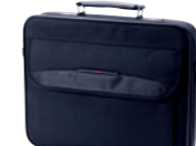
Carry Case – Value Edition