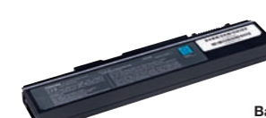
Battery – Li-Ion, 6 Cell, 4,400 mAh