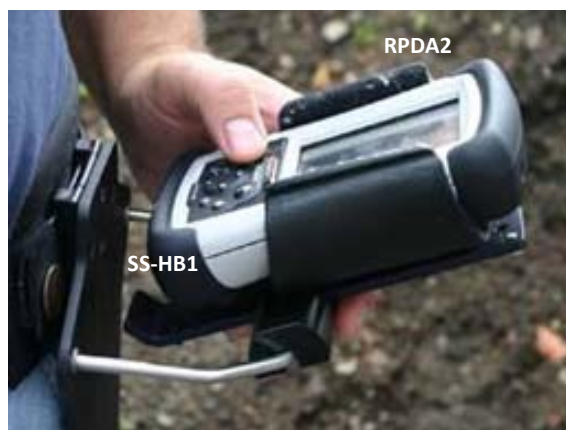
Rugged PDA with the Holster belt type SS1-HB1

The RPDA2 is an exceptionally robust handheld PDA which collects and analyses readings from the SunScan Probe. Raw readings, and derived functions such as LAI, can be displayed, reviewed and stored in the field by the SunData Software; groups of readings can be averaged if required. Readings are stored in the internal memory which holds >1 million readings, or in widely available CompactFlash cards which provide removable data storage. Collected data can be transferred easily to a PC.