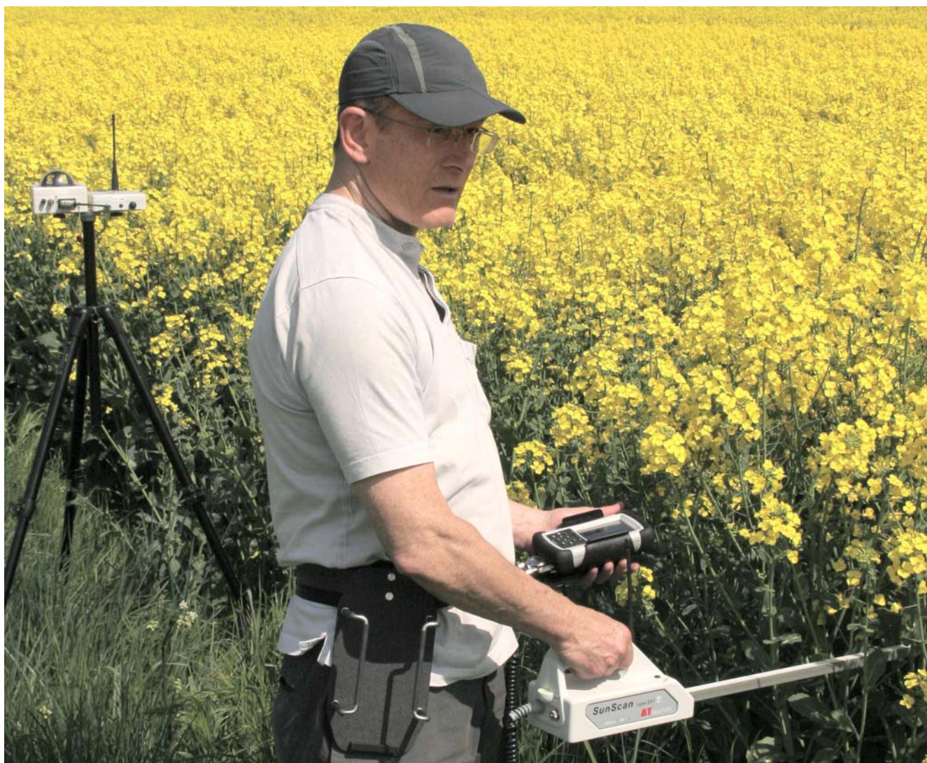
SunScan Probe (radio version) and PDA, with radio-linked BF5 Sunshine Sensor mounted on tripod