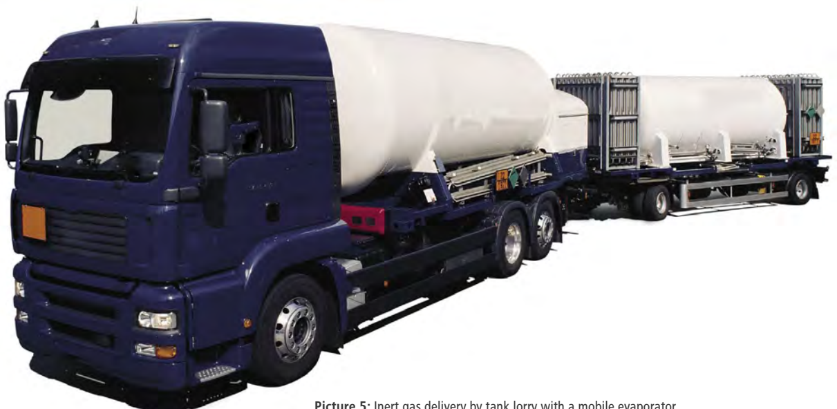
Picture 5: Inert gas delivery by tank lorry with a mobile evaporator