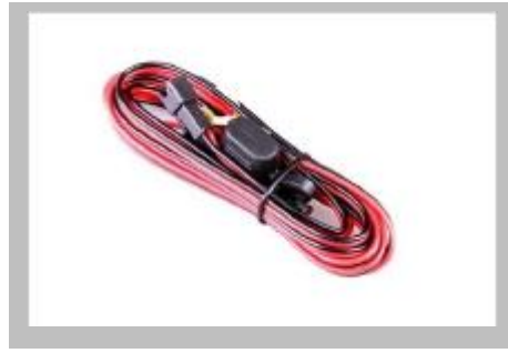
Charging cable (Standard)