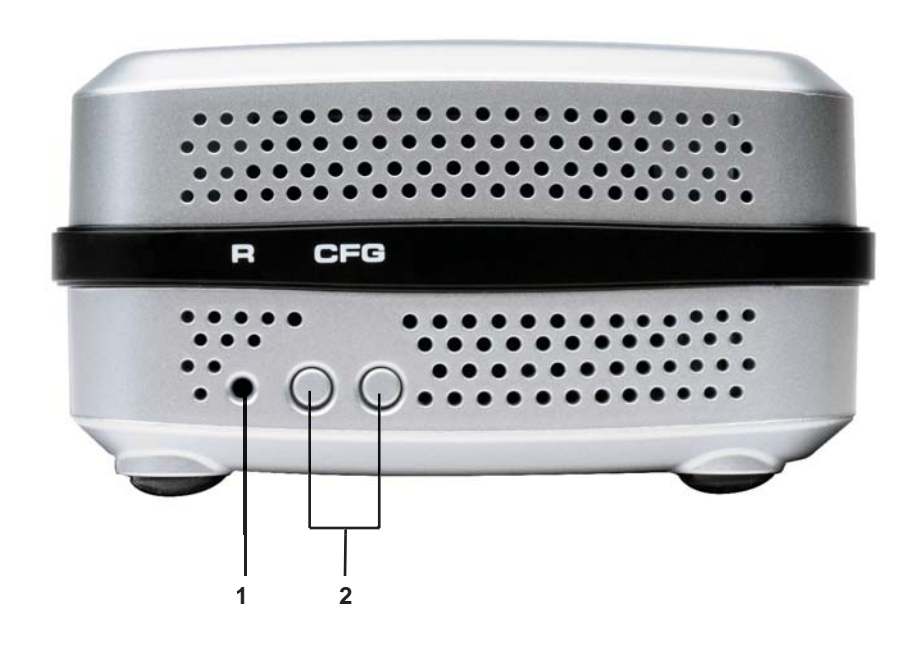
Front Right Panel Close-Up of LED Indicators