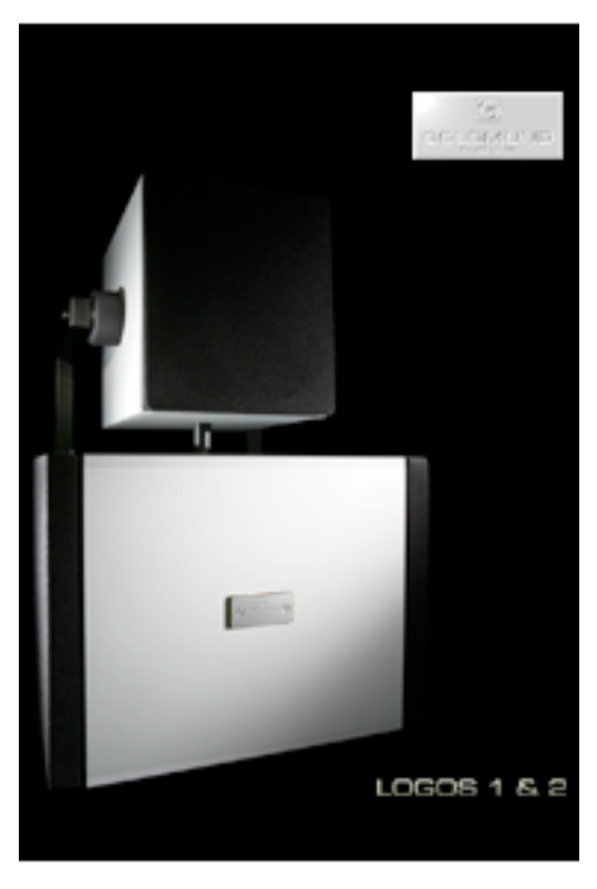
Goldmund Logos Speaker System Logos 1 with Logos 2 and LogosFrame

Nevertheless, if the instructions are perfectly carried out, you will notice that the sound quality of your Goldmund LO GOS 1 is naturally dynamic, precise and sweet.