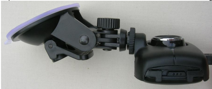
Suction pad mounting for the windscreen with threaded connector