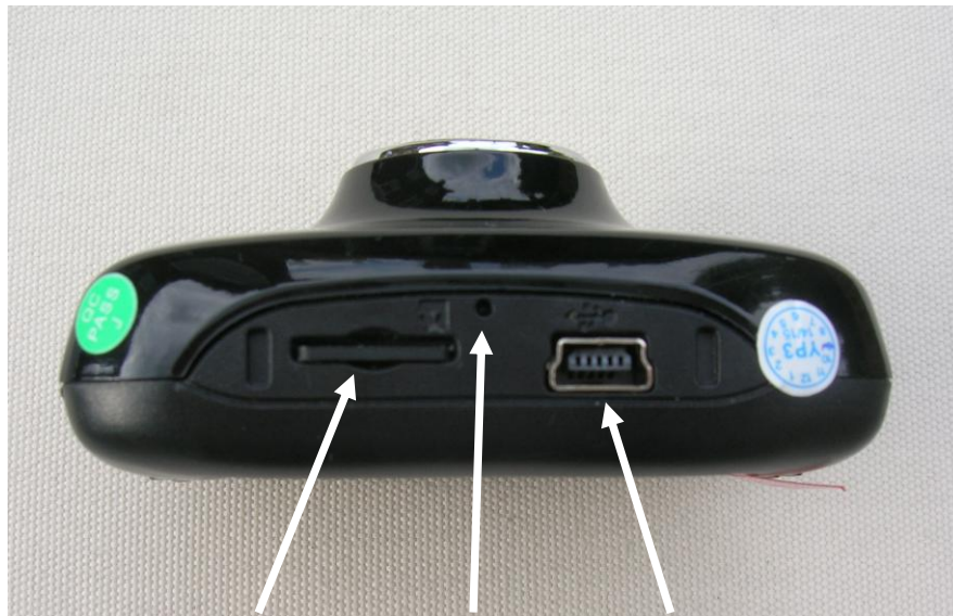
Underside: Memory card slot, Reset hole and USB socket