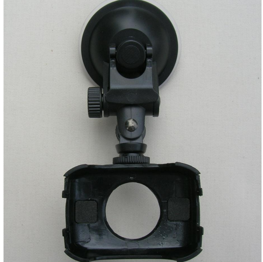
Back of the front shield where camcorder clips in – four side clips