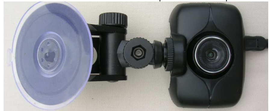
Camcorder located in the front shield with power lead connected