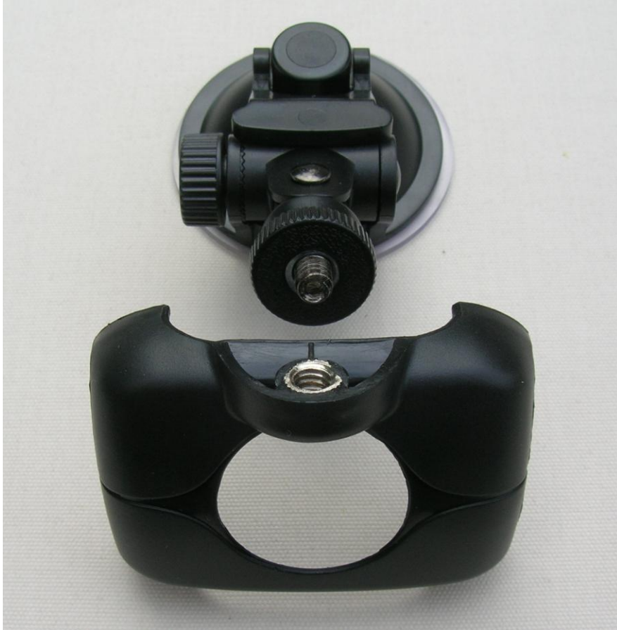
Clip-on front shield for the camcorder with a threaded link for the mounting