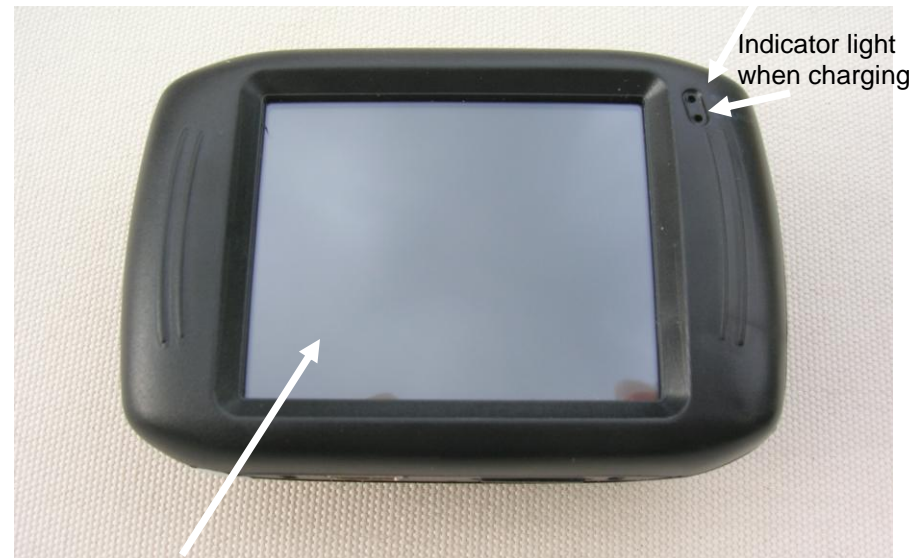
Back: LCD TFT screen (40mm x 30mm). (Front: Lens)