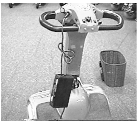
Battery Charger Hook up

4). There is no possible way to overcharge the battery as the charging voltage is set constant. In general, you may start charging before you go to bed at night and disconnect it in the next morning.