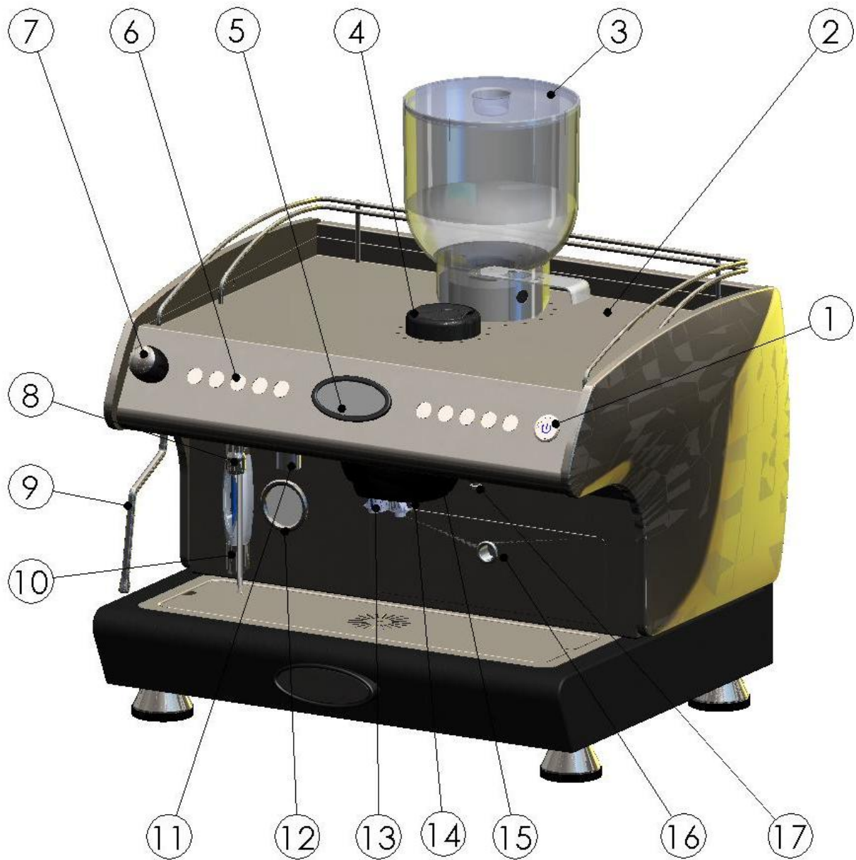
Cybercino Features Diagram