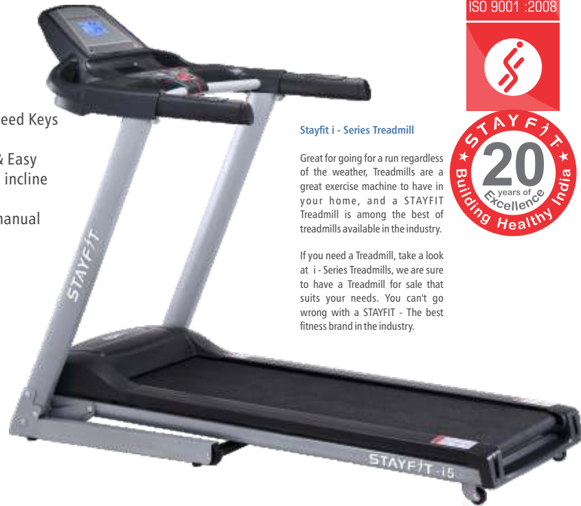
Stayfit i - Series Treadmill

Great for going for a run regardless of the weather, Treadmills are a great exercise machine to have in your home, and a STAYFIT Treadmill is among the best of treadmills available in the industry.