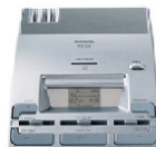
Every bit as easy as cassette transcription. Only smarter.