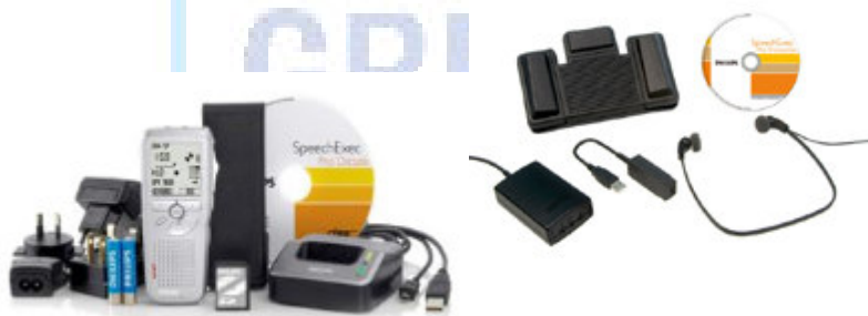
Telephone Desktop 9850