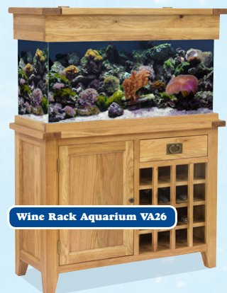
Wine Rack Aquarium VA26