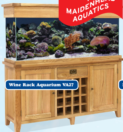
Wine Rack Aquarium VA27