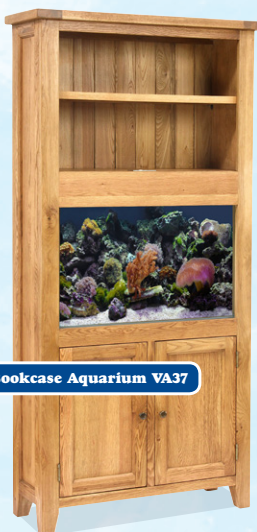
Bookcase Aquarium VA37

Full equipment sets (e.g. filtration, lighting, heater, etc) are available in our stores to complete your aquarium purchase. These aquariums are suitable for keeping all types of fish and would make a fantastic feature within your home or office!