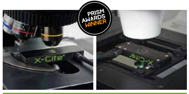
X-Cite<sup>®</sup> XP750 in use on upright and inverted microscopes

Since the X-Cite<sup>®</sup> XP750 measures light right on the stage, it can be used with any epi-fluorescence light source including: HBO / mercury, metal halide or xenon lamps, lasers and LEDs. With hundreds of wavelength choices, the X-Cite<sup>®</sup> XR2100 allows you to define 'favorite wavelengths' to correspond to your most frequently used sources and filters.