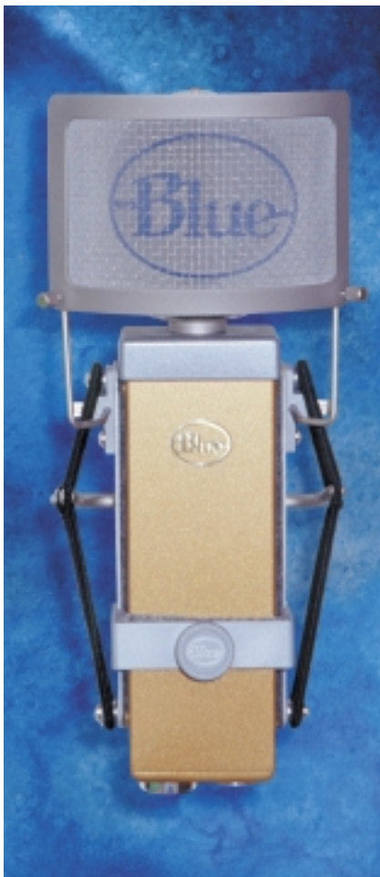
Cactus with Series One Shock/Pop

BLUE logo). Tighten the thumbscrew until the mic is secure within the cradle mount and won't slip out when hanging upside down. The angle of the yoke mount can be swiveled and adjusted with the large thumbscrew.