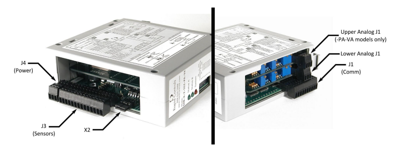
Figure 2.1 SAB-A Connector Locations

The connectors of the SAB-A are shown in Figure 2.1. A diagram of thes connectors is shown in Figure 2.2. Finally, Table 2.1] shows the pinout of the connectors.