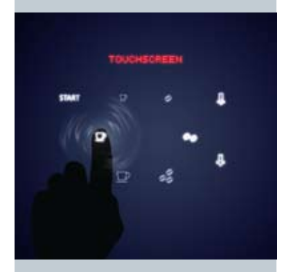
Touch & Go