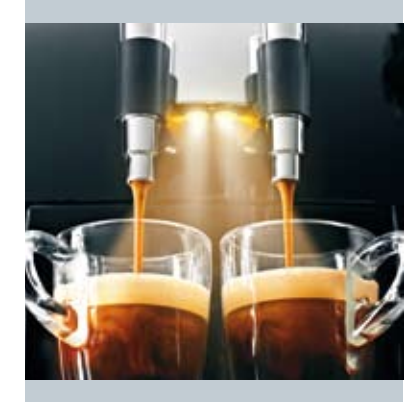
In the spotlight