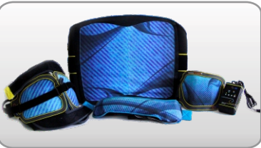
CLIMAWARE™ Rx Cryothermic™ System