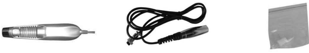
Mesogun with serum bottle Conductive probe The cover of serumbottle (White)