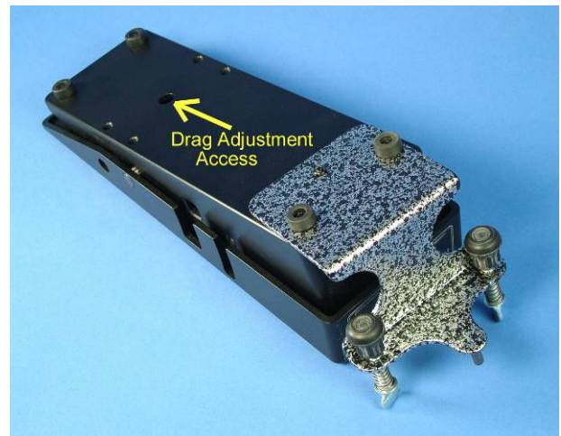
Pedal shown with Emmons-style mounting bracket