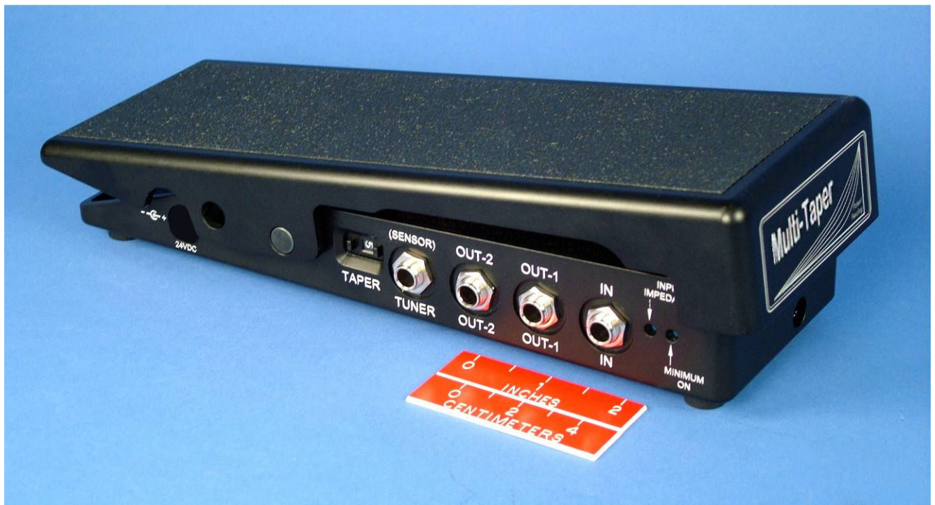
Typical FP-100 Configuration