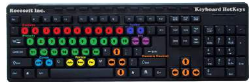
Keyboard Controls available when activated.