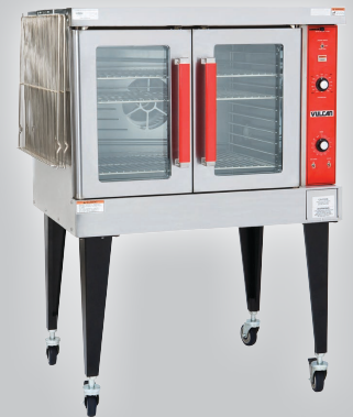
VC4ED Shown with optional casters and oven rack hanger