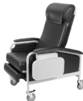
Convalescent (LTC) Recliners