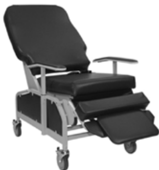
Specialty Chair Transfer Chairs