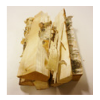
Figure 9. Properly stacked firewood.

The power of the sauna heater can be regulated by the ash drawer. If the ash drawer is closed, the power of the sauna heater is at its lowest and the burning time is longer. If it soughs too much in the sauna heater, reduce the draft. To do this close the ash drawer halfway or completely. This way heat reaches better in the sauna heater, stones can store heat and you do not just heat up the flue. A calm flame is a sign of a correct draft. Avoid heating the sauna heater so that the channels of the stone compartment glow red for a long time because this will overload the firebox and the service life of the sauna heater will be reduced. Overheating may also cause excessive heating of the smoke flue and cause a fire hazard. The connective flue pipe must not be glowing red.