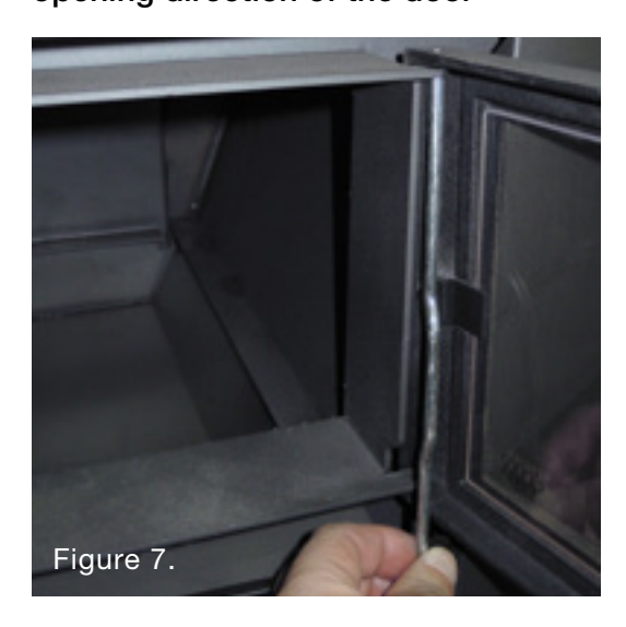
Figure 7. Open the door and raise the hinge pin up so it comes out of the bottom hinge barrel. Hold onto the door securely and turn the bottom part of the pin and turn the bottom end of the pin up enough (2) that you can pull the pin down (3) and the pin and door come apart. For installation proceed in reverse order. First push the upper edge of the door in its place and thereafter push the pin through the upper eyelet. Thereafter turn the door and pin in their places from below and let the pin into the bottom eyelet. The pin is correctly installed when the wider areas of the pin are facing down. In this case the pin cannot move away from its place. Door installation is easier when you use long flatnose pliers.