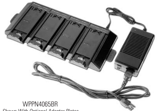
WPPN4065BR Shown With Optional Adapter Plates

The Motorola Conditioning Charger utilizes negative pulse charging technology that will help extend battery life and enhance battery operation. It will safely condition and charge your specified NiCd and NiMH batteries in approximately one to two hours. The MCC controls heat buildup due to its charging and termination algorithms, and the maintenance mode allows batteries to be safely left on the charger for extended periods of time. And now there is an Instant Fault Detection (IFD) feature which detects faulty radio batteries in seconds, then notifies the user that the battery will not operate at peak performance. Optional accessories are available allowing these chargers to be used in both AC and DC environments, providing optimal charging flexibility.