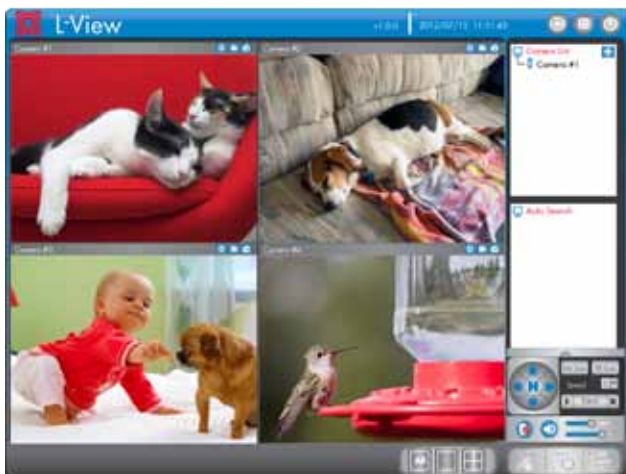
PC Viewing Application. (PC not included)