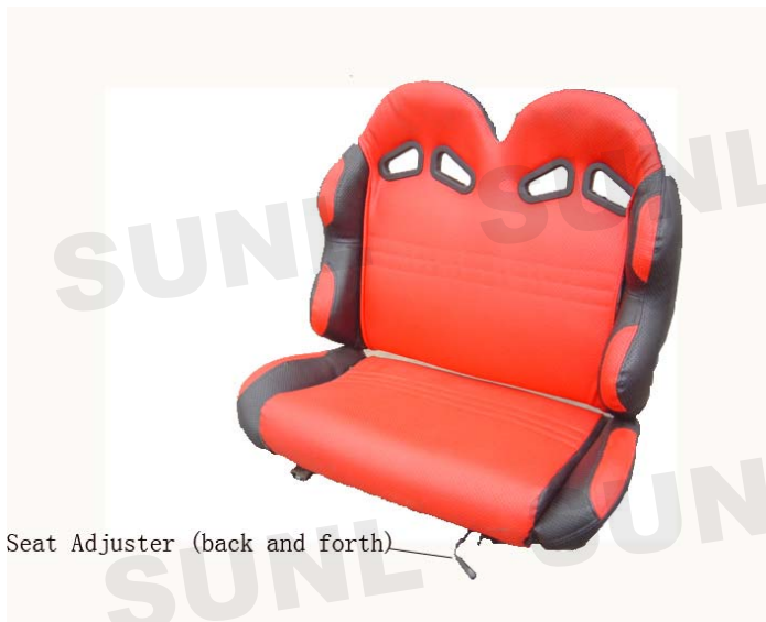
Seat Adjuster (back and forth)

You can adjust the location of Seat by moving the hand lever under the cushion. You can move the hand lever right and then move to the place necessary and loosen the hand lever. Attention: please resume the location of the hand lever.